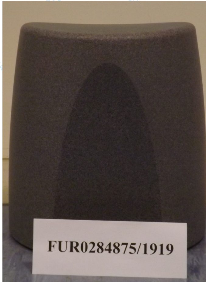
Front view of the 'Ryno Stool'