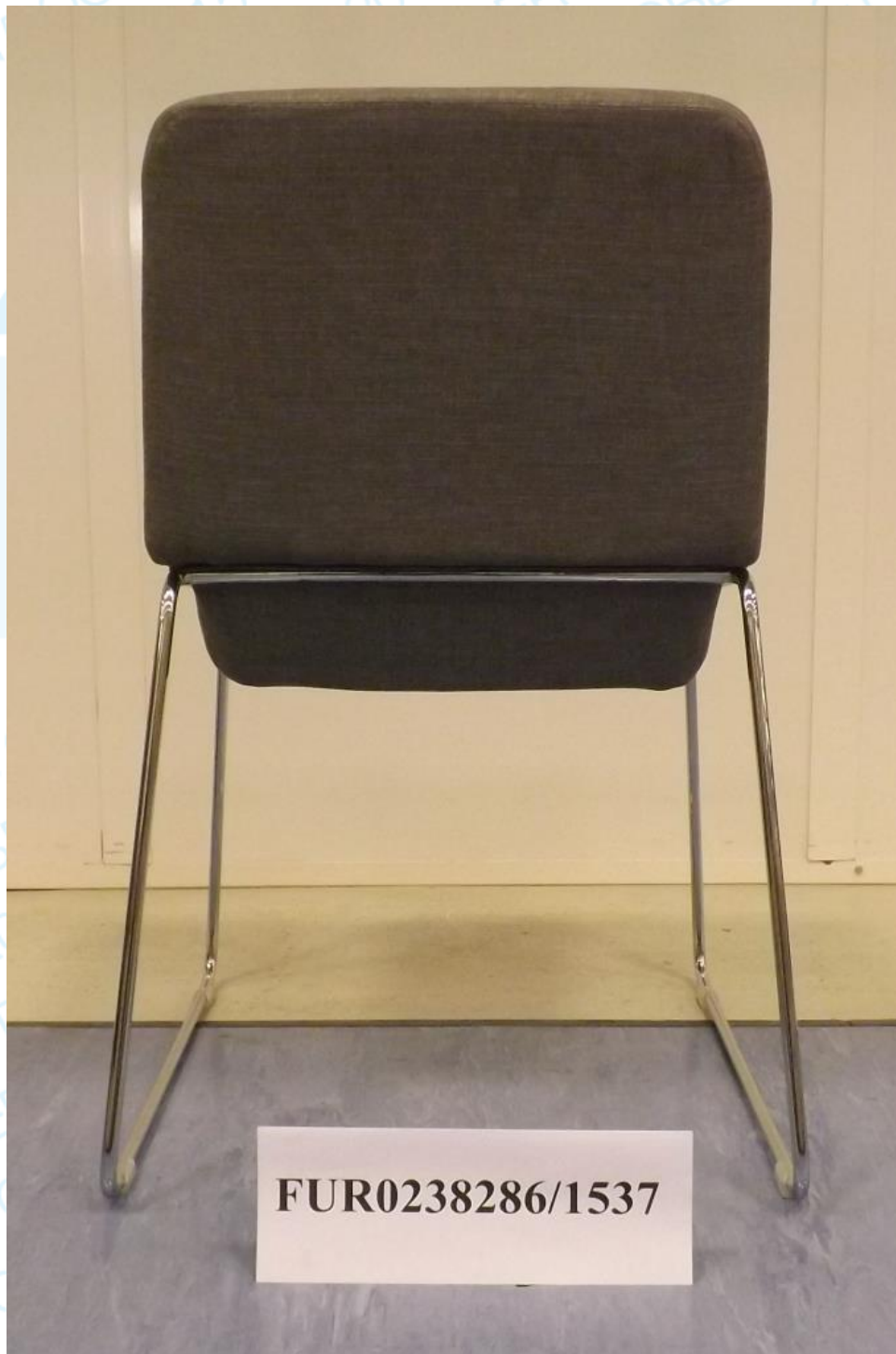
Rear view of the 'Kava Chair'