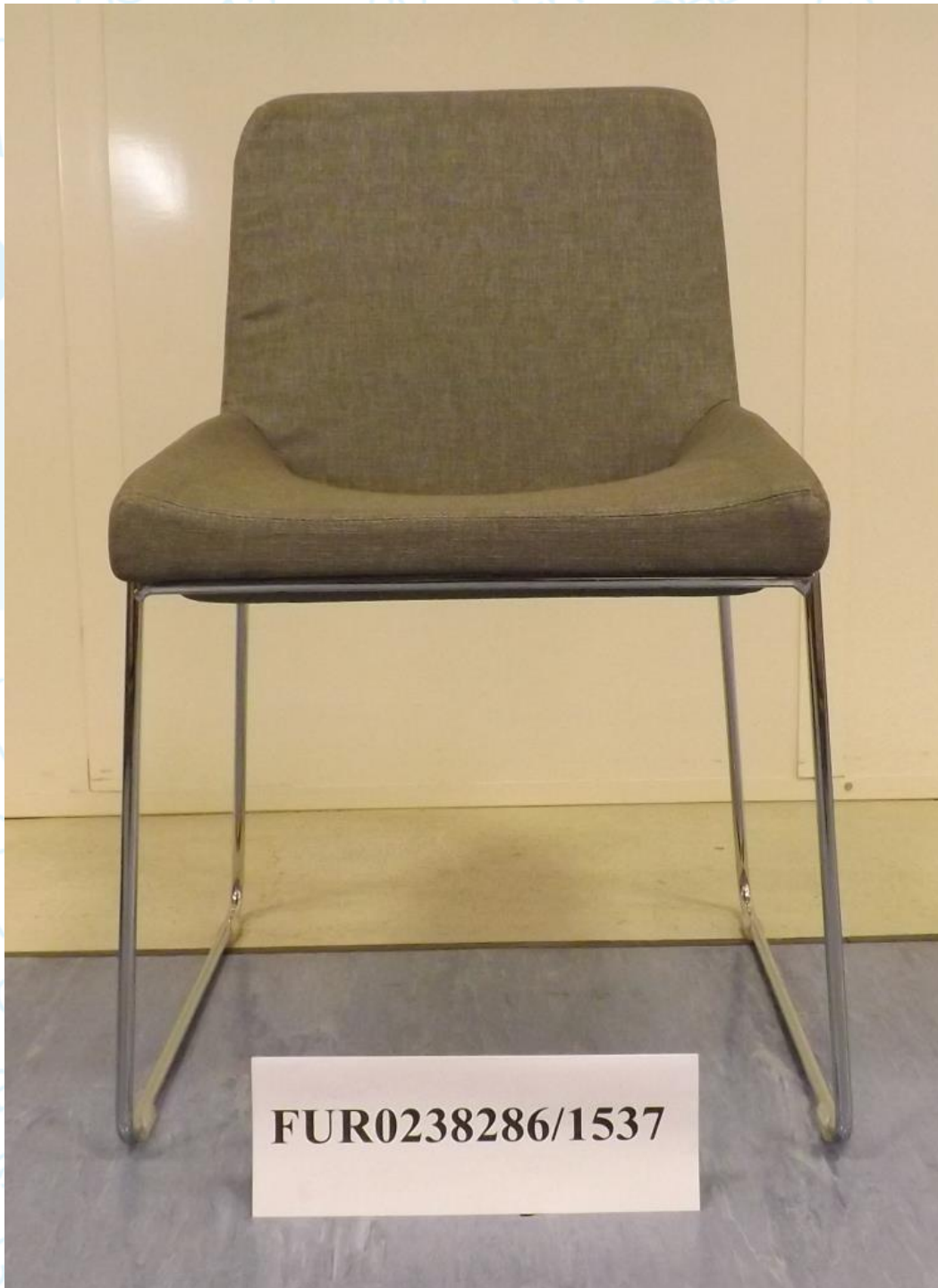
Front view of the 'Kava Chair'