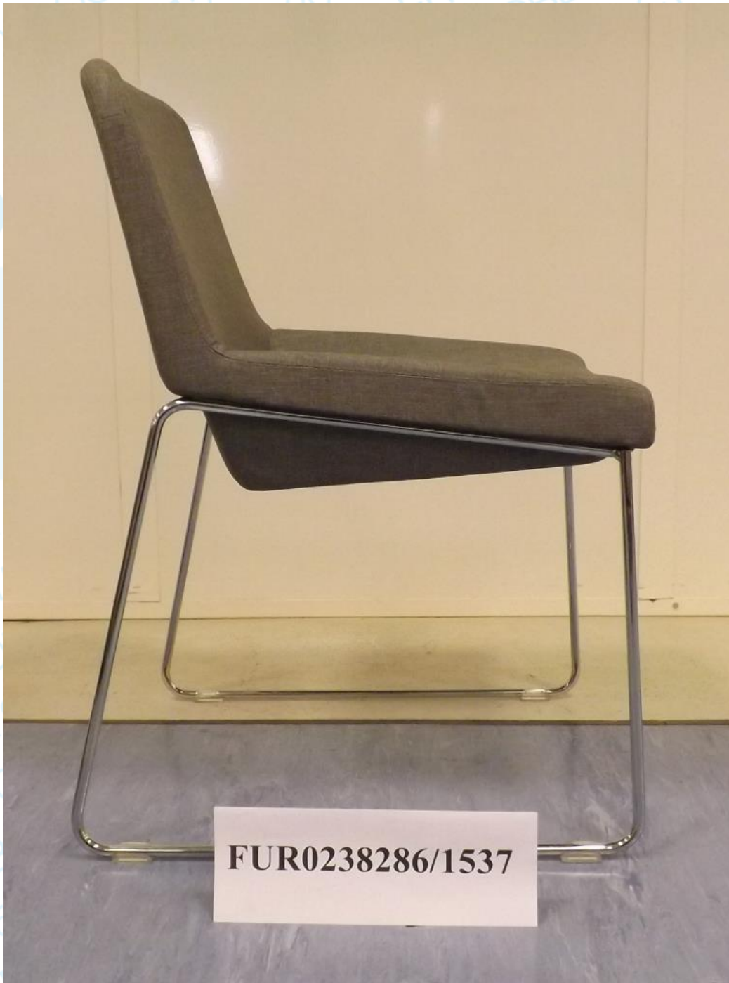
Side view of the 'Kava Chair'