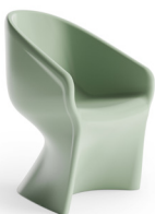
Club chair Unweighted: 18kg