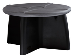
Dining table Unweighted: 35kg