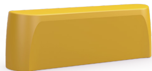
Bench Unweighted: 15kg