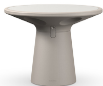
Pedestal table Unweighted: 30kg (floor fixed)