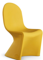
Dining chair Unweighted: 12kg