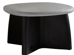
Dining/activity table Unweighted: 74kg