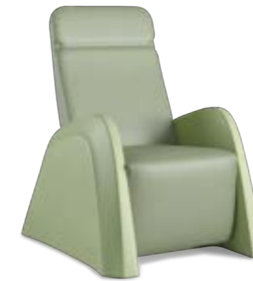
Levo reduced-ligature recliner Standard weight (90kg): 1LV1-00

Upright dimensions: 1229H | 852W | 1283D (mm)