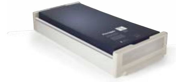
Solo profiling bed - side panel

Code: 1SOA-100 Bed size: 190-810H | 1060W | 2270L (mm) Weight: 149kg