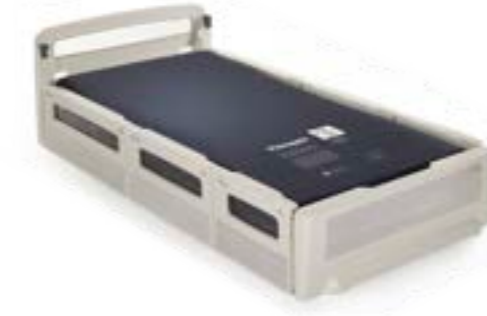
Solo profiling bed - 3 panel

Code: 1SOA-100 Bed size: 190-810H | 1060W | 2270L (mm) Weight: 149kg