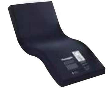
Flex profiling mattress

Code: 1SOA-200 Bed size: 190-810H | 1030W | 2250L (mm) Weight: 139kg