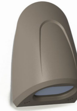
Fynn task light 1FY230 175H | 120W | 100D (mm)