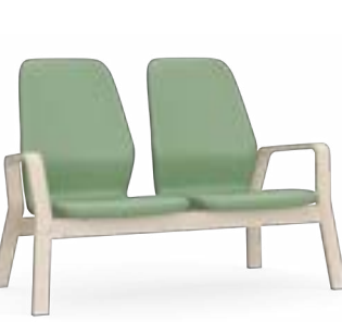
Famn lounge high back 2-seater 1FMH-400 1000H | 1250W | 770D (mm) Seat height 450mm Weight: 21kg