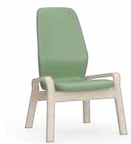
Famn lounge high back side chair 1FMH-300 1000H | 705W | 770D (mm) Seat height 450mm Weight: 11kg