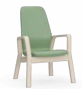
Famn lounge high back armchair 1FMH-400 1000H | 705W | 770D (mm) Seat height 450mm Weight: 11.5kg