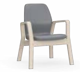
Famn lounge low back armchair 1FML-400 850H | 705W | 700D (mm) Seat height 450mm Weight: 10.5kg