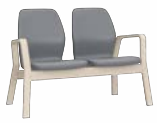
Famn lounge low back 2-seater 1FML-400 850H | 1250W | 700D (mm) Seat height 450mm Weight: 19kg