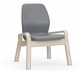
Famn lounge low back side chair 1FML-300 850H | 705W | 700D (mm) Seat height 450mm Weight: 10kg