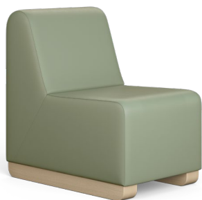
Ohio single seater Solid ski legs: 1OP1-430 Solid plinth base: 1OP1-700 830H | 550W | 826D (mm) Seat Height: 452mm Weight: 36kg