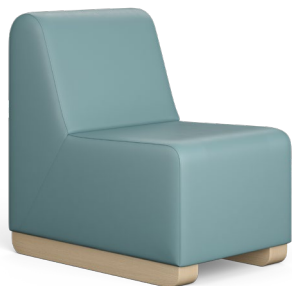
Ohio single seater