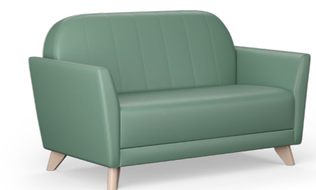
Henley 2-seater Solid birch feet: 1HNW2-200 Chrome metal feet: 1HNM2-200 863H | 1432W | 783D (mm) Seat height: 433mm Weight: 46kg