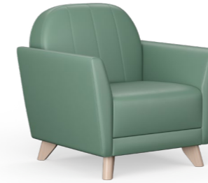
Henley Plus armchair Solid birch feet: 1HNW1-900 Chrome metal feet: 1HNM1-900

863H | 837W | 783D (mm) Seat height: 433mm Weight: 43kg