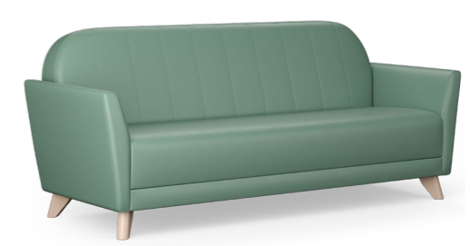
Henley 3-seater Solid birch feet: 1HNW3-200 Chrome metal feet: 1HNM3-200 863H | 2027W | 783D (mm) Seat height: 433mm Weight: 68kg