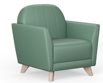
Henley armchair Solid birch feet: 1HNW1-200 Chrome metal feet: 1HNM1-200 863H | 837W | 783D (mm) Seat height: 433mm Weight: 32kg