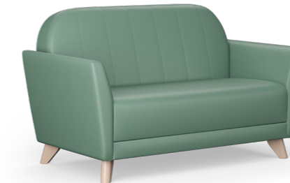
Henley Plus 2-seater Solid birch feet: 1HNW2-900 Chrome metal feet: 1HNM2-900

863H | 837W | 783D (mm) Seat height: 433mm Weight: 43kg