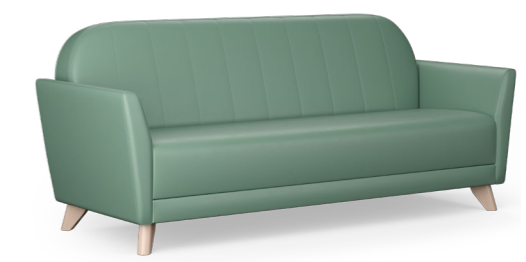
Henley Plus 3-seater Solid birch feet: 1HNW3-200 Chrome metal feet: 1HNM3-200

863H | 1432W | 783D (mm) Seat height: 433mm Weight: 72kg